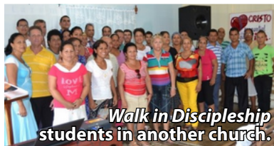
Walk in Discipleship students in another church.